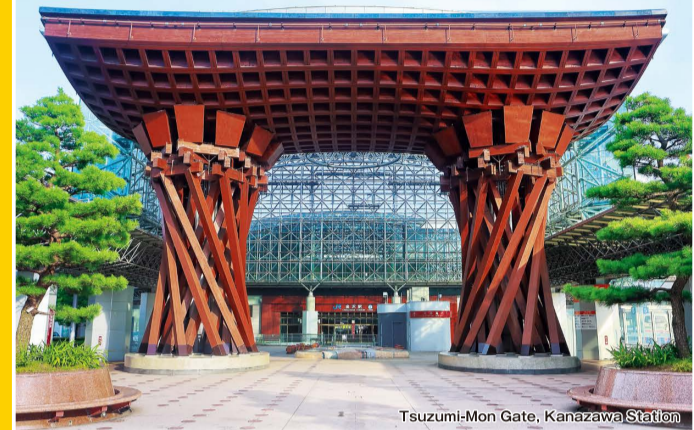
Tsuzumi-Mon Gate, Kanazawa Station

Images are for illustrative purposes only.