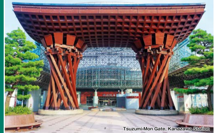
Tsuzumi-Mon Gate, Kanazawa Station

Images are for illustrative purposes only.